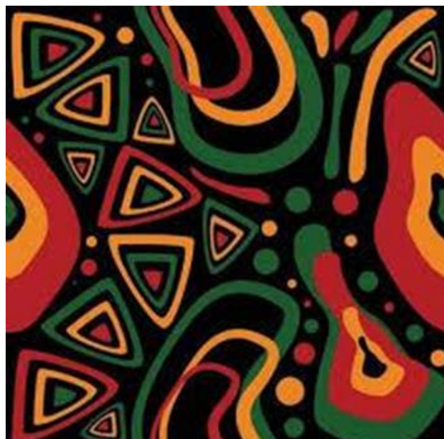
The image is an African 'chitenge' showing its versatility and diversity which reflects our personalized formation.

We form young women by reinforcing Gospel values for transformation for a better society in the future. Through collaboration with other African Holy Cross provinces, we offer flexibility, diversity, and inclusivity in our formation programmes to embrace young women who come from other African countries, with different cultures and languages. This open formation setting challenges our province to embrace otherness.