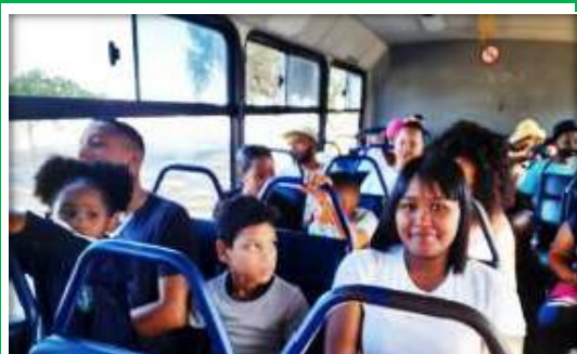
Educational Excursions that include families,

Children aged 6 months to 5 years attend our Educare Centres situated among the poor.