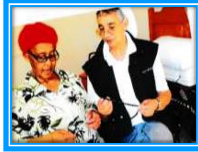
...teaches the praying of the Rosary.