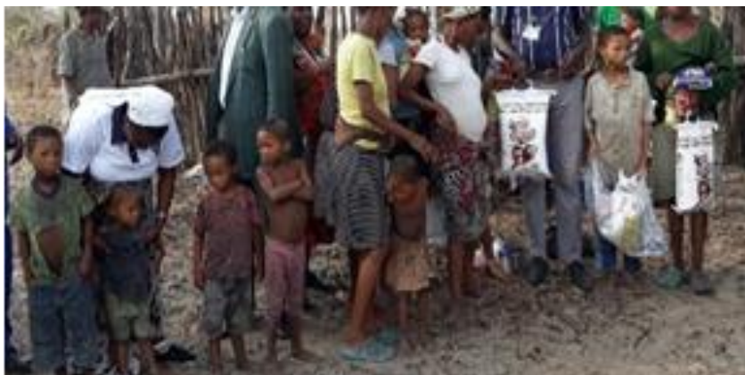
Our sisters working among the San People in Okongo, Namibia