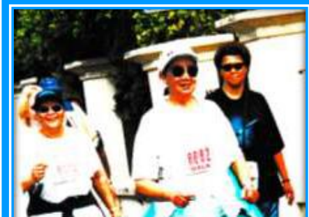
Annual 10 km Big Walks for the elderly...