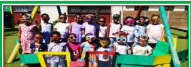
Fun days are included in the program: Today is Crazy Sunglasses day!