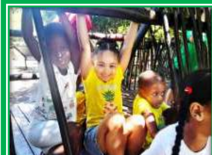
...happy children enjoying outdoor activities...