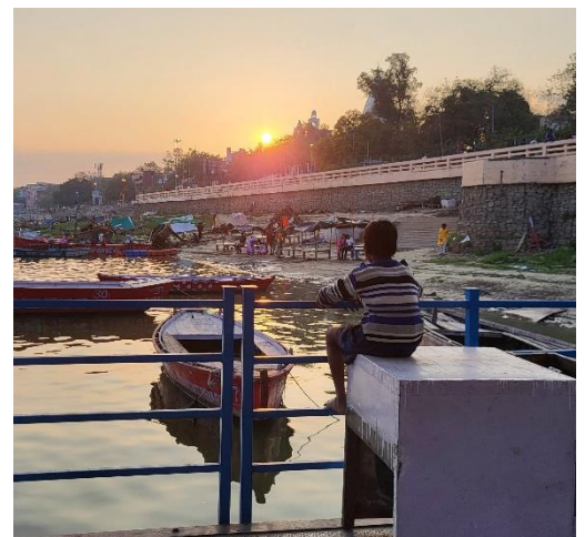
The photos were taken by me during the Visitation of the Northern Indian Province