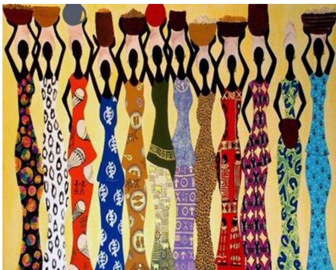
Image depicts our call to mission and reflects our shared humanity.

We have trained lay leaders with an understanding of our identity to take leading roles in our institutions.