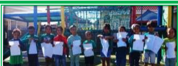
Children learn to associate colours with values: Green for RESPONSIBILITY