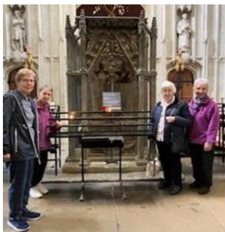
Sisters on pilgrimage to the tomb of St Alban

There are several opportunities we have had since the General Chapter 2019, to develop our formation: