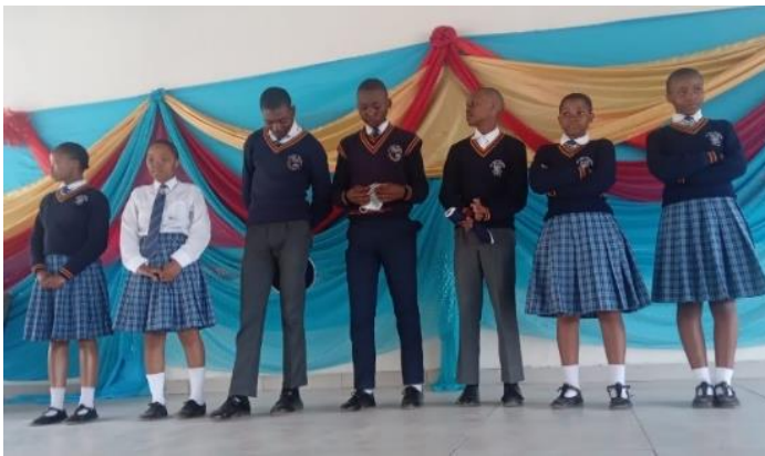
Inauguration of School Leaders at Holy Cross High School St. Elizabeth Training Institute students (Feast of the Holy Cross)

Learners in our schools were also empowered through seminars organized by the provincial leadership to encourage young people to participate in leadership roles. After they completed their training to elect their leaders, these leaders in turn took up various ministries of importance in the school.